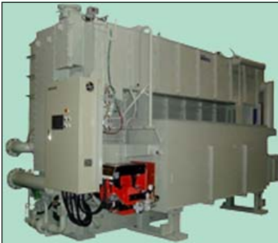
A SAB-DF series chiller from AET

Advanced Ergonomic Technologies (AET), the United Kingdom, has launched a range of direct gas-fired absorption chillers. These high-performance units can supply both chilled water and hot water for industrial and commercial building applications. AET's SAB-DF Series of dual-effect, direct-fired absorption chillers provides key environmental benefits. The chillers use water as refrigerant rather than chlorine-based compounds, such as hydrofluorocarbons (HFCs) and hydrochlorofluorocarbons (HCFCs).