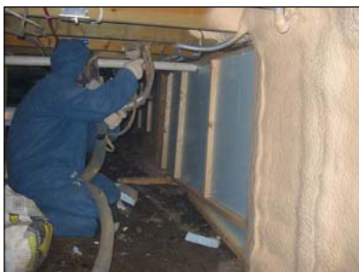
Polarfoam Soya being sprayed on

Polarfoam PF-7300-0 Soya Spray foam insulation from Thermo Seal Insulation Systems, Canada, is a closed-cell, medium-density spray foam made from renewable vegetable oils, soybean oil and recycled plastics. Polarfoam Soya is produced using a unique manufacturing process patented by Demilec of Canada. The spray polyurethane foam offers high-performing, durable insulation to reduce energy consumption. The product has zero impact on the ozone layer.