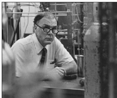
Dr. F. Sherwood Rowland in his laboratory

Dr. F. Sherwood Rowland died at his residence in Corona del Mar, California, the United States. He was 84. Dr. Rowland's discovery in 1974 of the danger that aerosols posed to the ozone layer was initially met with disdain but was ultimately vindicated with the 1995 Nobel Prize in Chemistry. Industry