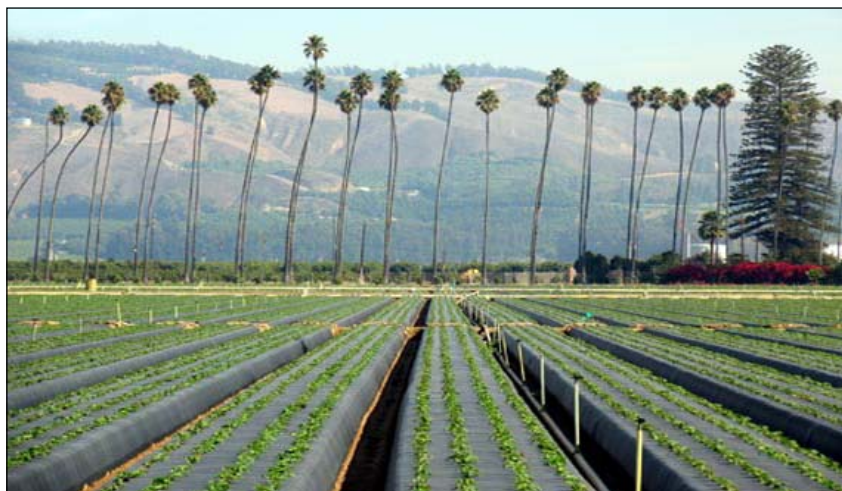
An experimental strawberry cultivation in California