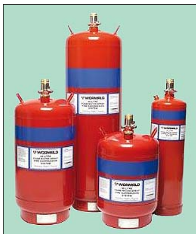
Wormald fire extinguisher systems

Wormald, Australia, offers environmentally friendly fire suppression systems that protect buildings and their occupants from fire. Both Inergen and SAPPHIRE systems contain agents that neither deplete ozone layer nor produce synthetic greenhouse gases. The Inergen fire suppression systems use an inert gaseous fire suppressant consisting of the natural gases, nitrogen, argon and carbon dioxide. Inergen is dry, electrically non-conductive and leaves no residue behind.