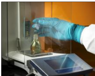
AE-3000 series fluorinated solvent

Rx11-flush is a unique solvent that has been engineered for flushing refrigeration and air conditioning systems. Its patented HFC based solvent formulation is powerful enough to flush away sludge, carbon residue, oils, acids, water and other particulate. This makes it ideal for system flushing after burnouts, retrofits and for flushing line sets for R-410A conversions. It is non-toxic, non-flammable and is non-ozone depleting.