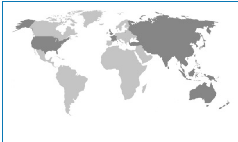
The shaded areas of the map indicate ESCAP members and associate members