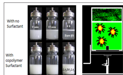
Surfactant stabilized drug particles

A series of novel co-polymer surfactants with the general structure LAmEOnLAm were developed along with a Colloidal Probe Microscopy (CPM) method to optimize the surfactant composition using adhesion forces to improve stabilization of drug dispersions at the Wayne State University, USA. This expands the range of biomolecules and micronized drug particles that can be formulated with pMDIs. New pharmaceutical compositions can be tested and the ideal co-polymer surfactant composition optimized through quantitative measurement of cohesive forces. The biodegradable and biocompatible lactide-based amphiles chosen can stabilize drug dispersions in HFA propellants used in pressurized metered dose inhaler (pMDIs) formulations better than existing excipients.