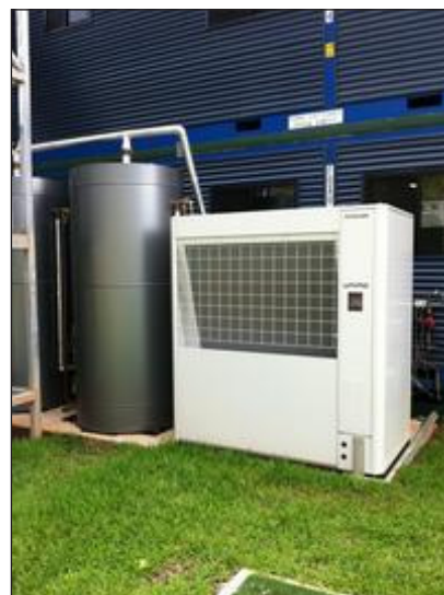
A Mayekawa Unimo air-to-water heat pump installation in Australia.

Over the past 35 years, refrigerants have come under fire — both for their impact on the Earth's protective ozone layer and for their global warming potential (GWP). HCFC-22 (R-22), a hydrochlorofluorocarbon, has long been the most common refrigerant. But it is being phased out according to the international treaty to protect the Earth's protective ozone layer.