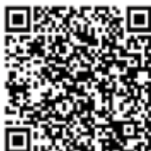
Technician Handbook on Good Service Practices and Installation of Room Air-conditioners