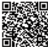
Flyer on Training and Certification of Refrigeration and Air-Conditioning Service Technicians (English)